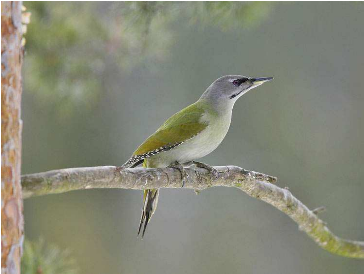
Grey-headed Woodpecker